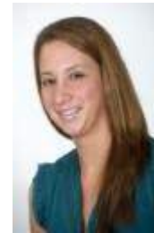
Assistant Study Programme Manager