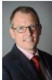
Study Programme Manager