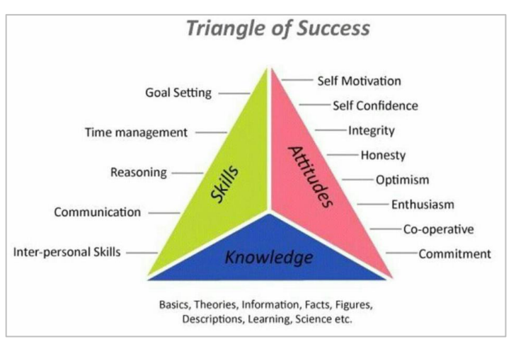
Figure 3: Success triangle [source Lyman Macinnis]

In this minor, each student is assessed on 6 different aspects, based on the triangle of knowledge, skills and attitude, see Figure 3. See Table 1 for these different aspects.